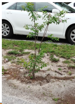
As of July 1st