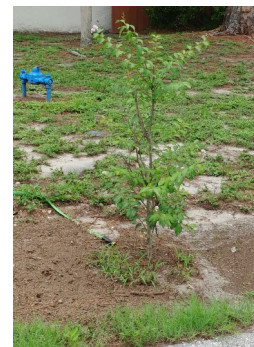
As of July 1st