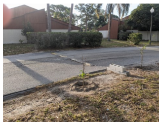
First Day Planted